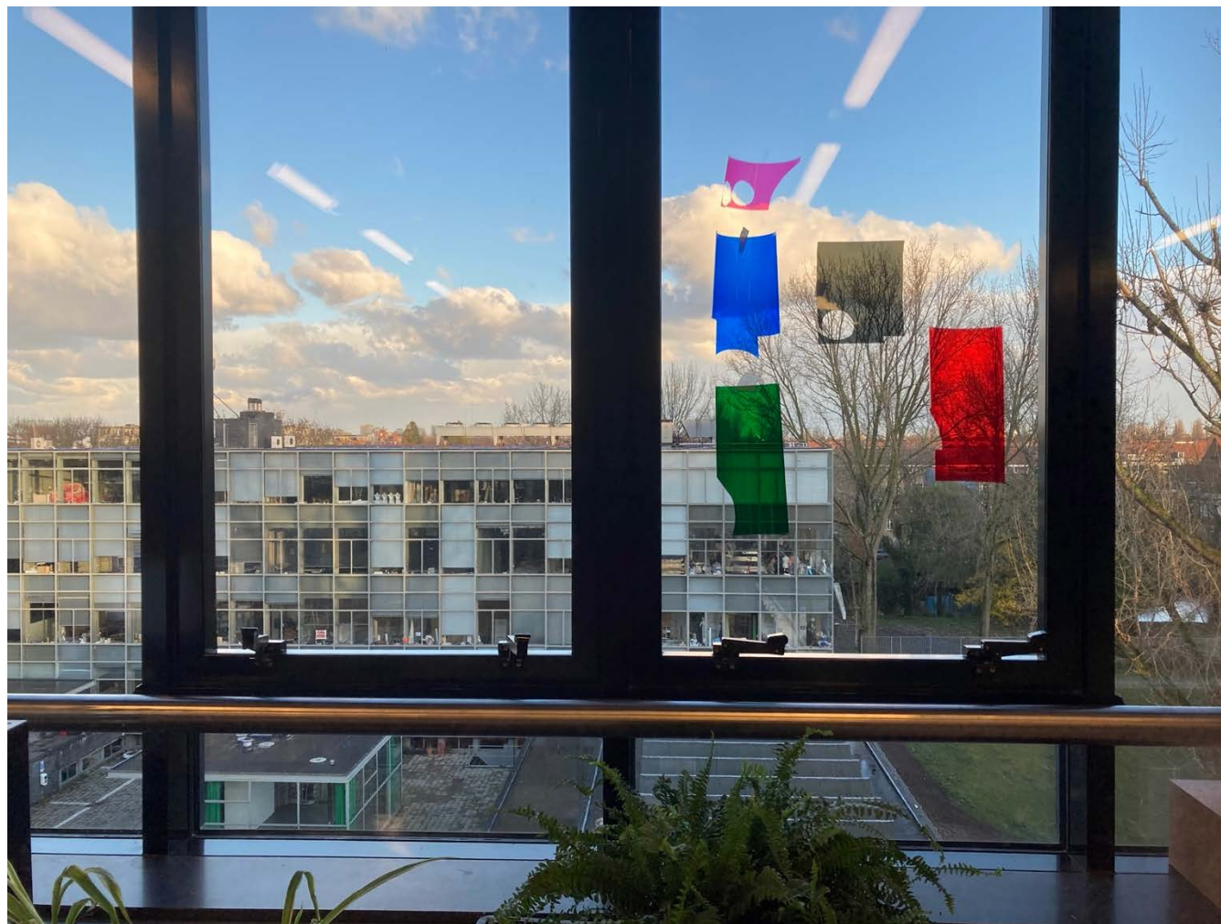
Room with a view.

Dear students. Thank you for all your enthusiasm and interest in the Medialab!