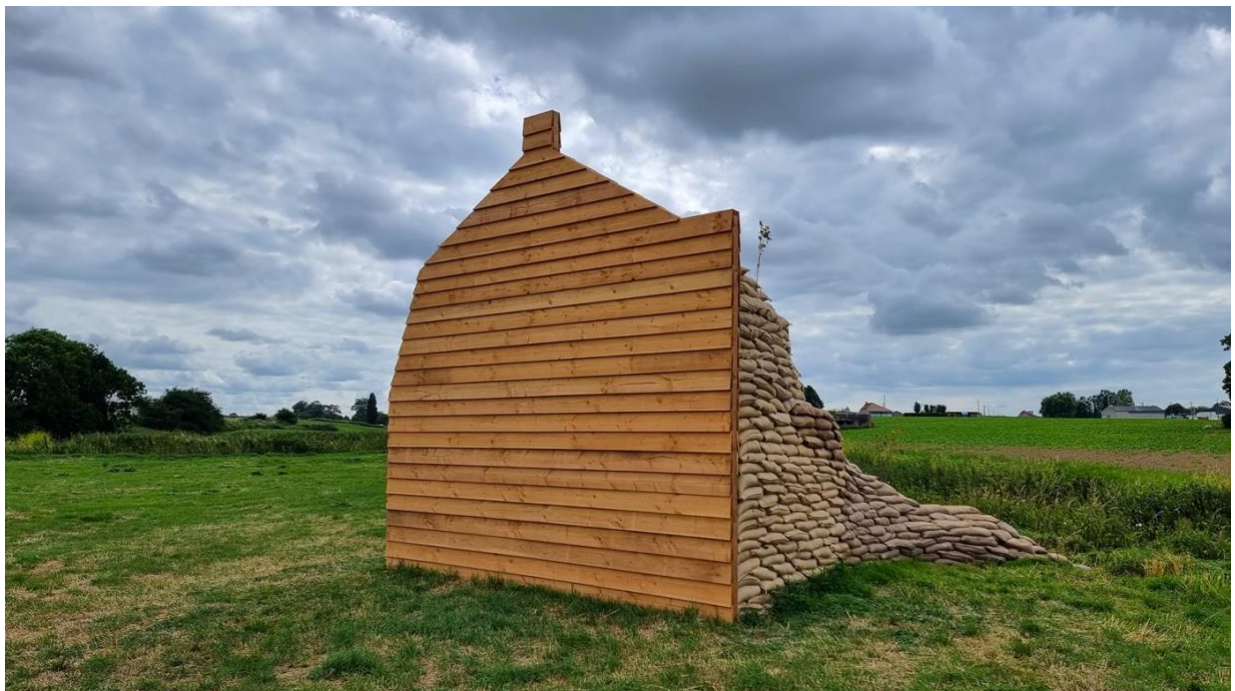
Nabijheid / Proximité BE by Niels Albers, Sculpture, 2023 Kunstenfestival Watou, Watou, Belgium