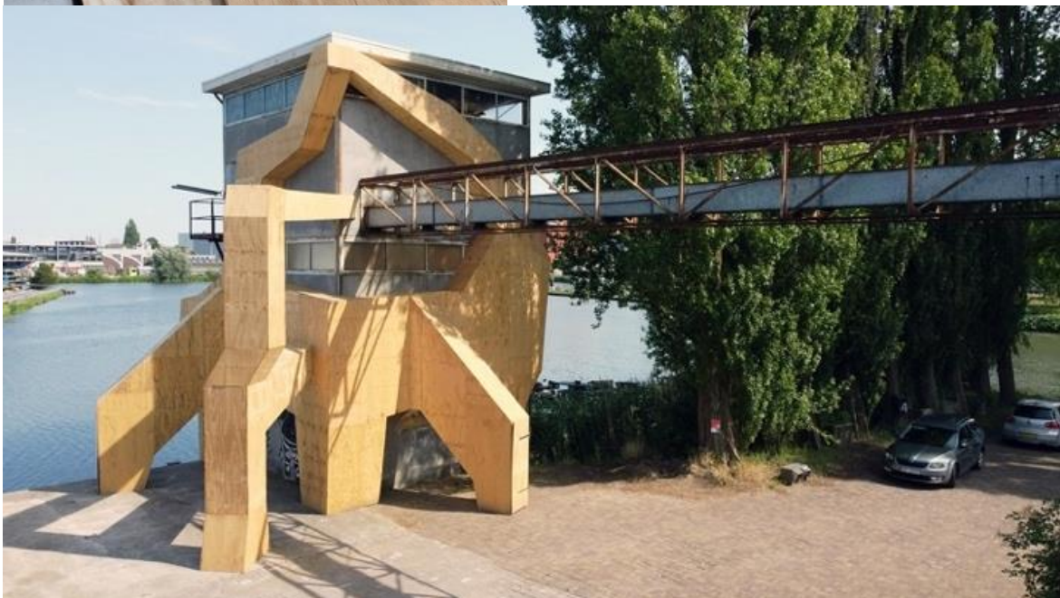
Epifyt-D by Niels Albers Architectural intervention, 2023 IJsselbiënnale, Deventer, The Netherlands