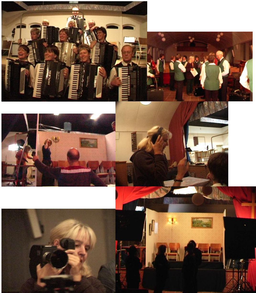
Making of 'Striving for Improvement' by Ineke Bakker (few years ago☺)

https://www.eyefilm.nl/whats-on/het-filmblik/1081160?show=1081512